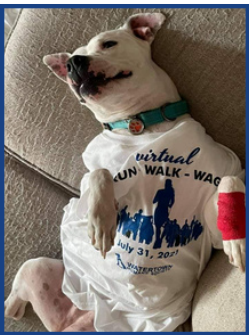
Alumni Halo relaxes in her Run-Walk-Wag shirt after her walk