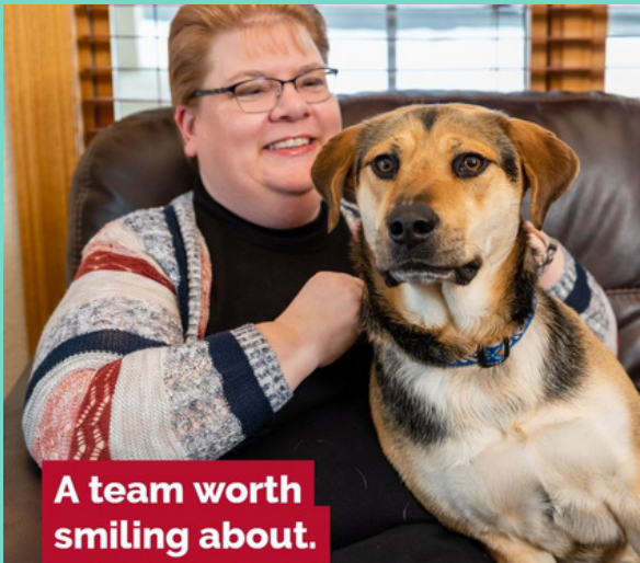
A team worth smiling about.