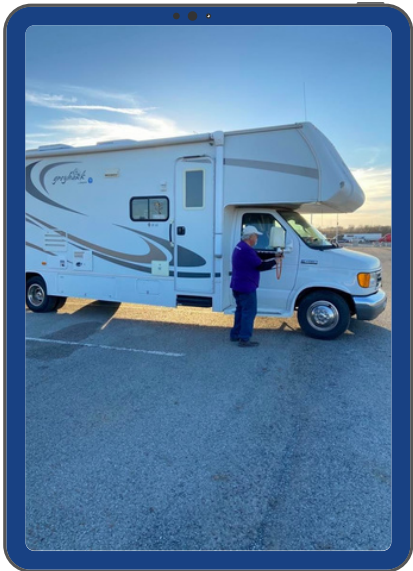
Driven by a dedicated volunteer, one of the Shiloh-mobiles gets ready for a road trip to save unwanted dogs.