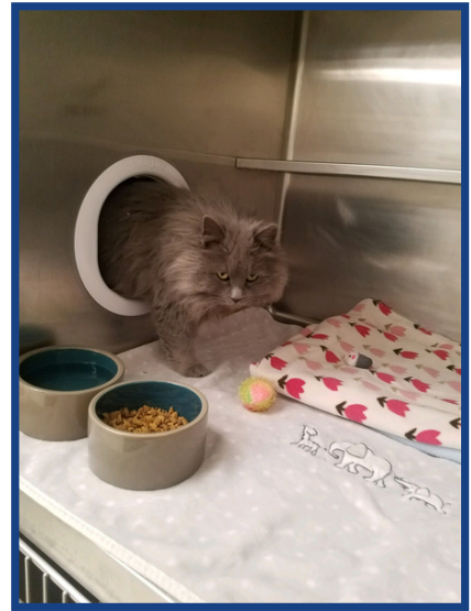
Adoptable pet Truly tests out cat portals

The Watertown Humane Society's Animal Care team has been working hard to get cat portals installed in each existing cat kennel thanks to the grant provided from the ASPCA Northern Tier Shelter Initiative. Cat portals allow existing cat kennels to be transformed into double compartment cat condos. The benefit is this allows for a separation of their food, bedding, and litter which makes the cat more comfortable and provides them a much cleaner space to reside. The Watertown Humane Society animal care staff has been working hard to make positive changes to their care procedures in order to reduce the feline population in building. This dedication has allowed space for the portals to be installed.