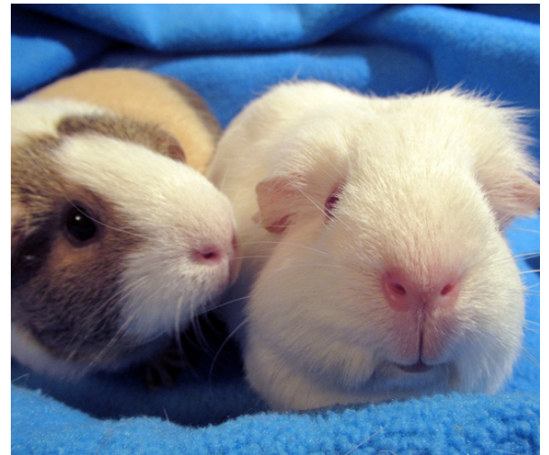
FIG and LUNA

"2020 brought something really great for Alumni Kita. She finally decided to allow a friend into her life. We had tried to introduce her to another guinea pig for some time, and that included Anna with no luck and Kita would have none of it. However time and persistence paid off and Kita adores the elder Anna, and Anna loves having a partner again since her friend Eva passed away."