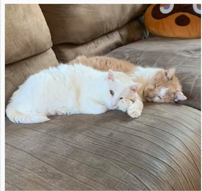
Petunia (FKA Ice Princess) and her new cat friend